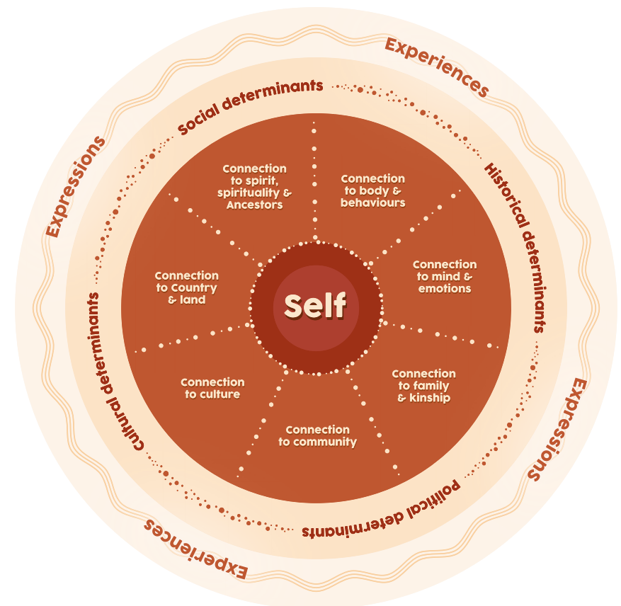
SEWB Diagram adapted from Gee et al., (2014)

Social and emotional wellbeing is also used by some people from culturally and linguistically diverse backgrounds, who may have differing concepts of mental health and mental health concerns.